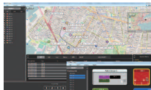
Main AVL screen