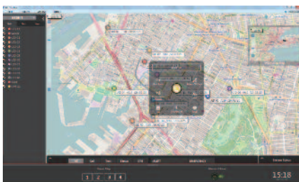
AVL: Unit Operation