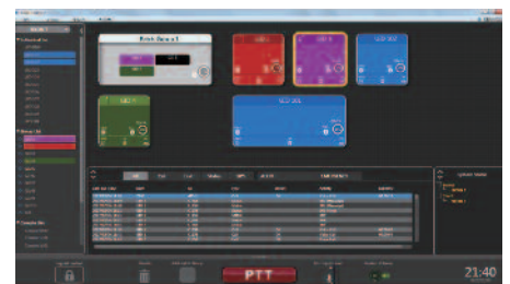
Dispatch: List Display

Specifications are subject to change without notice, due to advancements in technology. NXDN® is a trademark of JVCKENWOOD Corporation and Icom Inc. NEXEDGE® is a registered trademark of JVCKENWOOD Corporation. OpenStreetMap® is open data, licensed under the Open Data Commons Open Database License (ODbL) by the OpenStreetMap Foundation (OSMF). Microsoft, Windows, and SQL Server are trademarks, or registered trademarks of Microsoft Corporation in the U.S. and/or other countries. Intel and Core are trademarks of Intel Corporation in the U.S. and/or other countries. All other trademarks are the property of their respective holders.