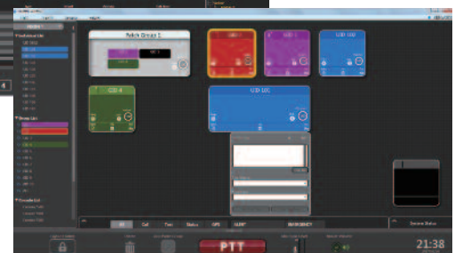
Main Dispatch screen